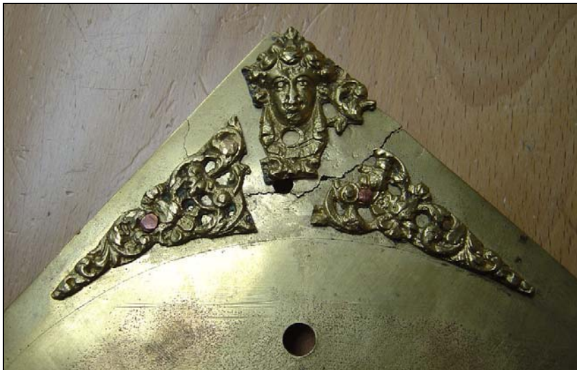
Here is a past and very poor repair to the same damaged corner; this also shows the fatigue crack. This old repair made with copper rivets had to be removed first. After the dial plate was repaired I then repaired the spandrel with silver solder and gold lacquered to match.