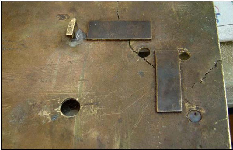
The fractures in the cast brass dial plate have been stabilised by applying two riveted applied straps of brass.