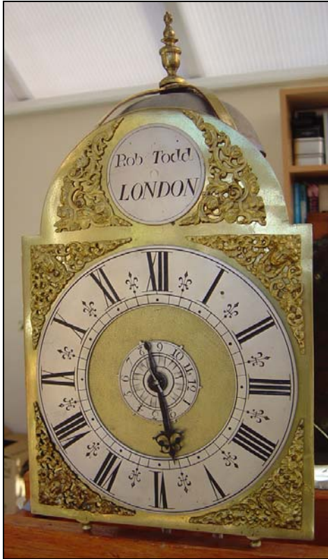
The clock after the work was completed