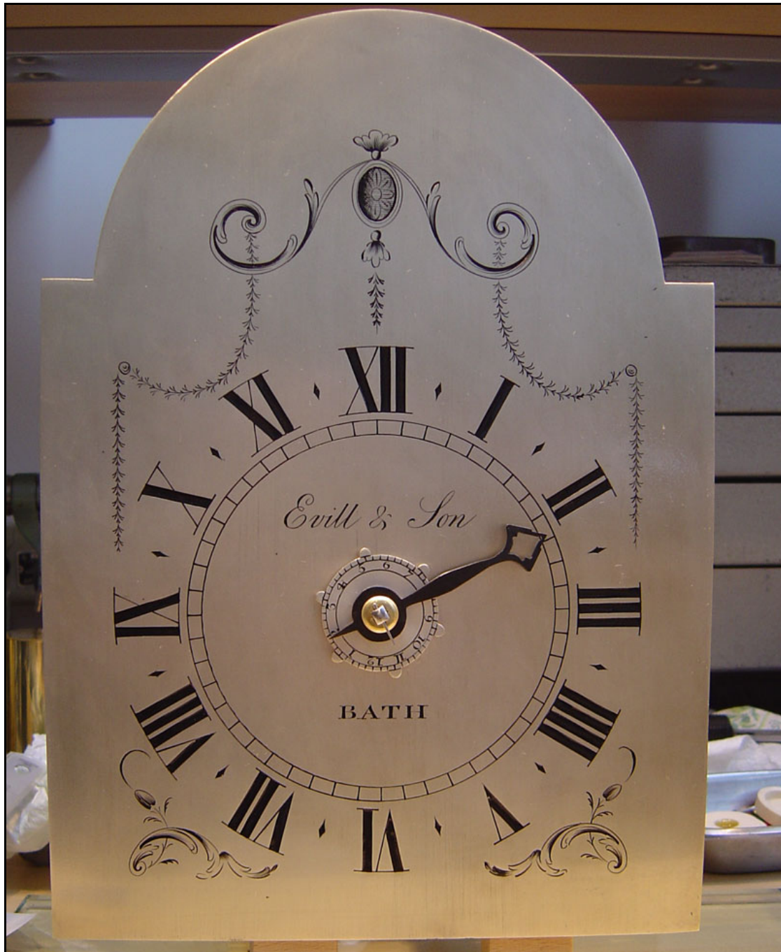
The dial after repair