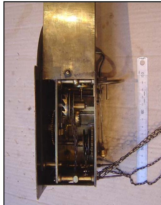
The clock in received condition