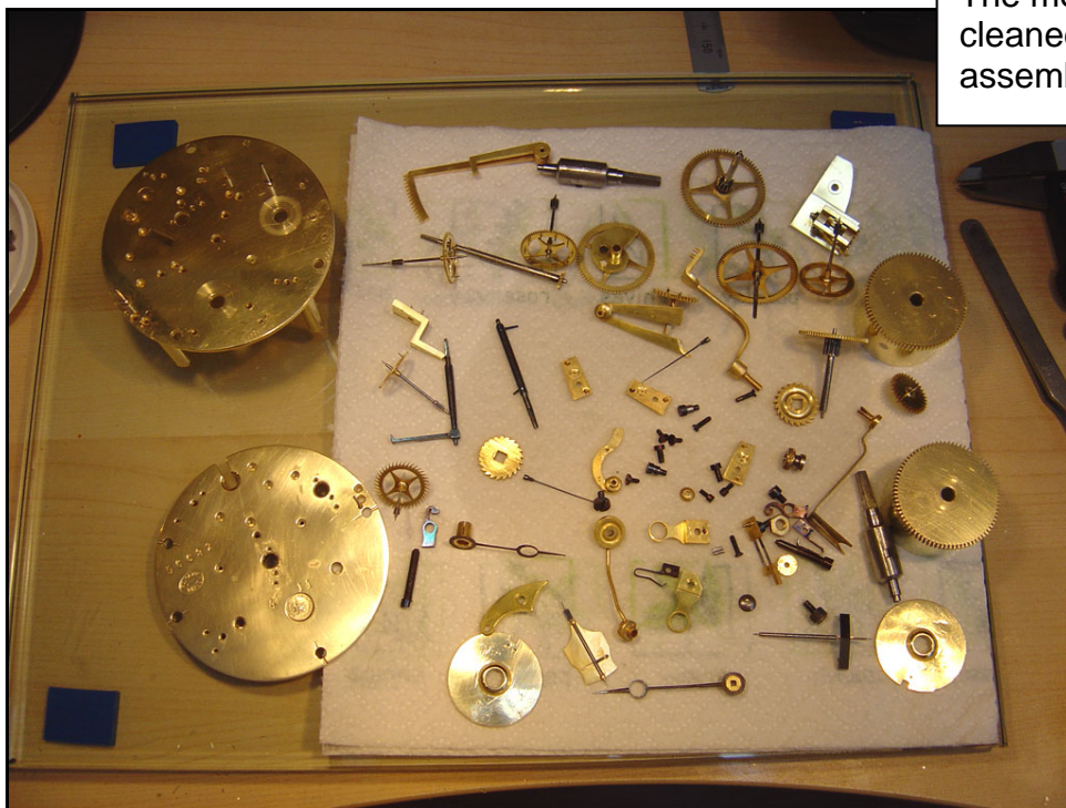
The movement now cleaned and ready for assembly