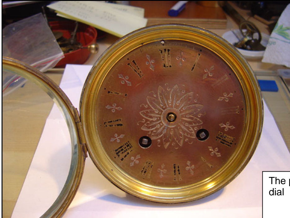
The poor state of the dial

This French marble mantle clock with Japy movement had been presented to the owners Great Grandfather in 1873 but was now in a very sad state. The movement had very tired springs and needed quite a bit of work. Another big problem was the dial and case which had been badly worn during the many years of family ownership.