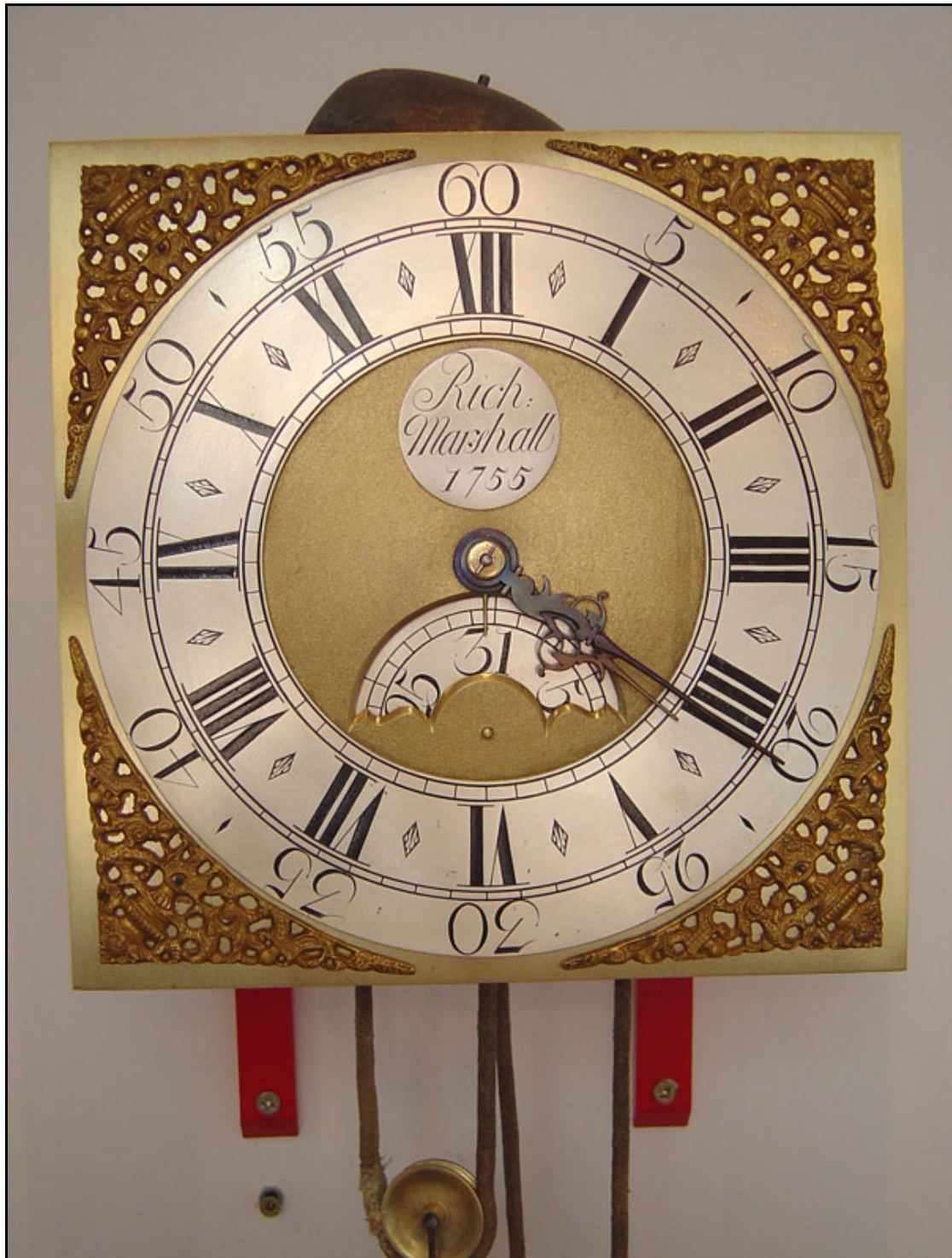
The dial after restoration