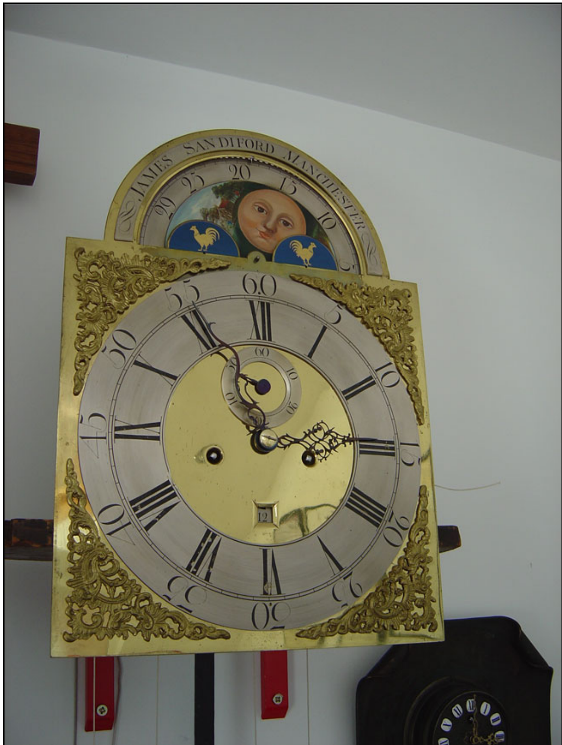
The horrors of too long a time between services, this one had been 30 years!!!

A long case clock has lots of power from the heavy driving weights and will sometimes run for years without lubrication until the pivots just wear away and turn into ferric oxide. I hate to see this happen, call me and I can protect your investment in a wonderful antique such as this.