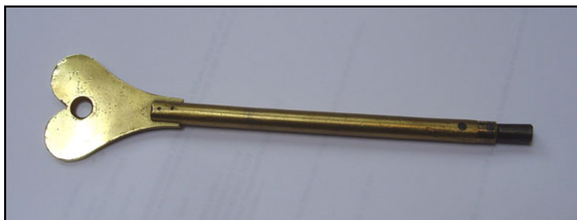
The very long winding key